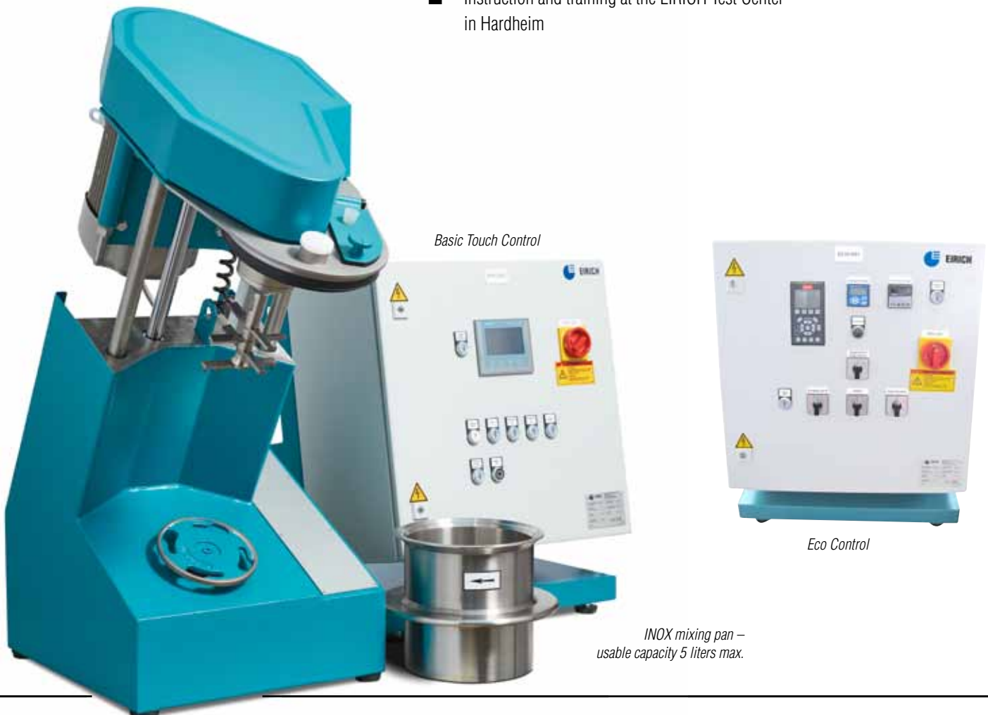
Basic Touch Control